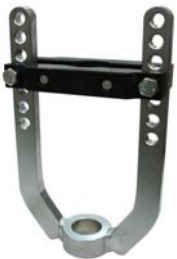
AMR1352R: CV Joint Puller