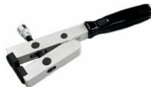
AMR1683L: CV Boot Band Pliers